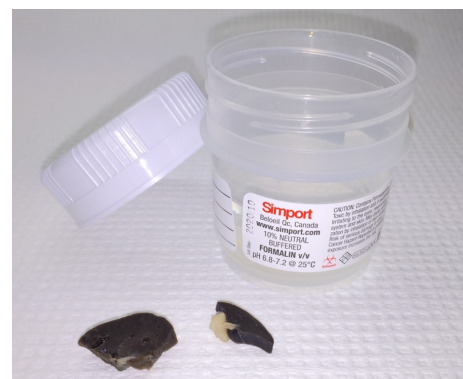
Figure 2: Formalin-fixed spleen and liver for rapid PCR testing to confirm infection with F. tularensis .