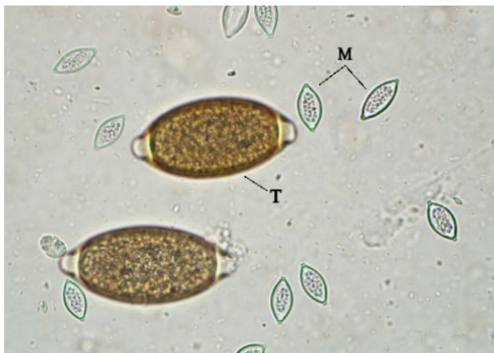
Figure 1: Monocystis sp. spores (M) have a similar shape as Trichuris sp. eggs (T), but are much smaller.